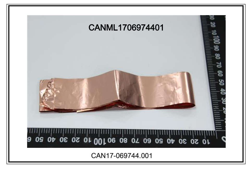
SGS authenticate the photo on original report only